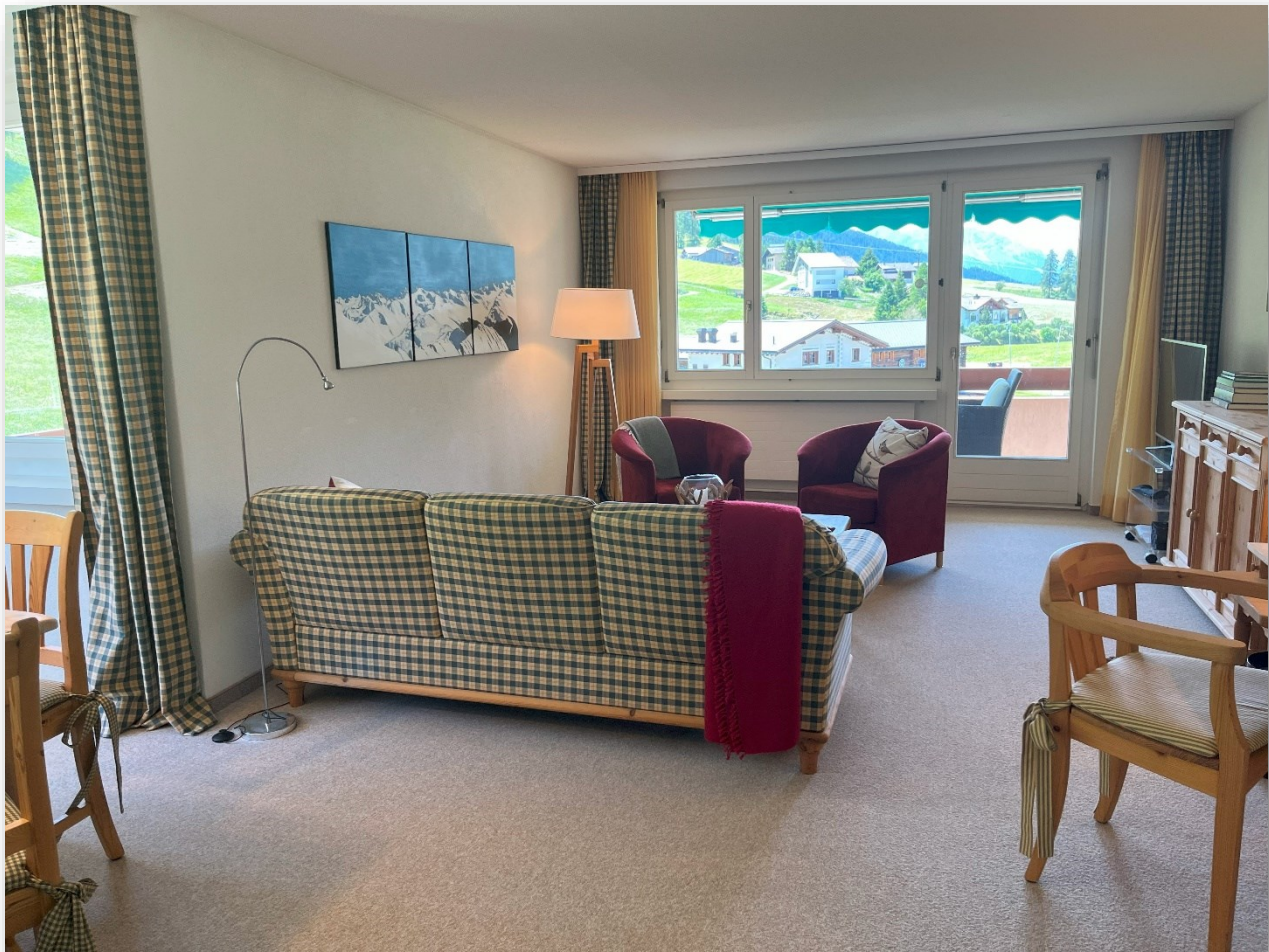
Lounge and dining table