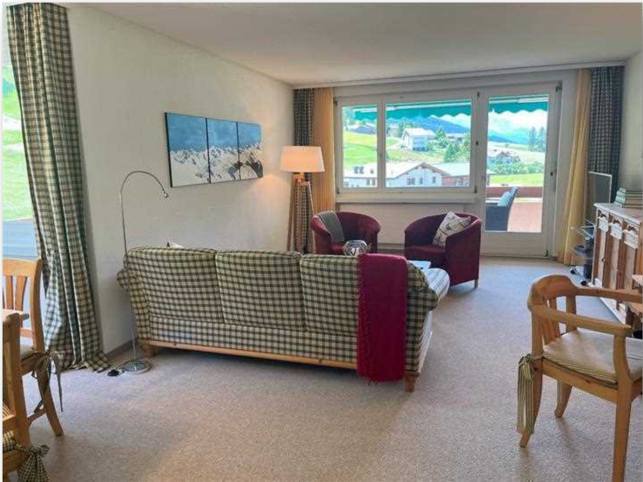
Lounge and dining table